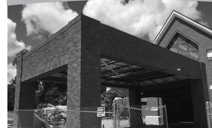
New covered entry

Sunday Services, July 31, 2016 Worship services 8:30 a.m. and 10:45 a.m. Sunday School Classes for all ages 9:45 a.m.