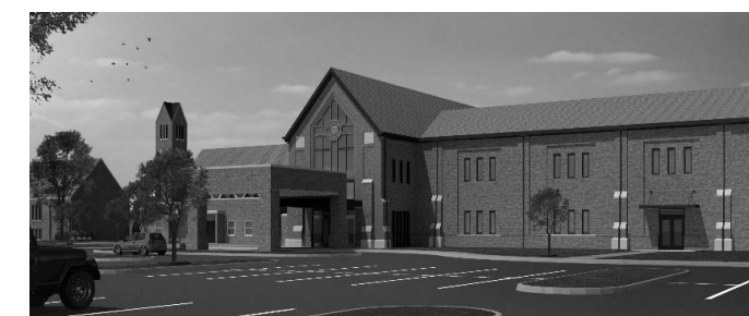
Architect's rendering of the New Building