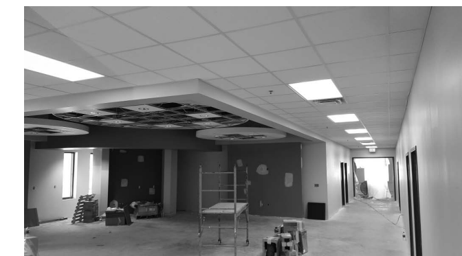
Upstairs Student Ministry common area

Please be aware that the elevator will not be operational during these tours, so those with mobility problems will be limited to the first floor. Also, remember that this is an active construction zone, so please wear appropriate shoes for your tour.