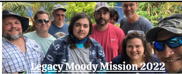
Legacy Moody Mission 2022