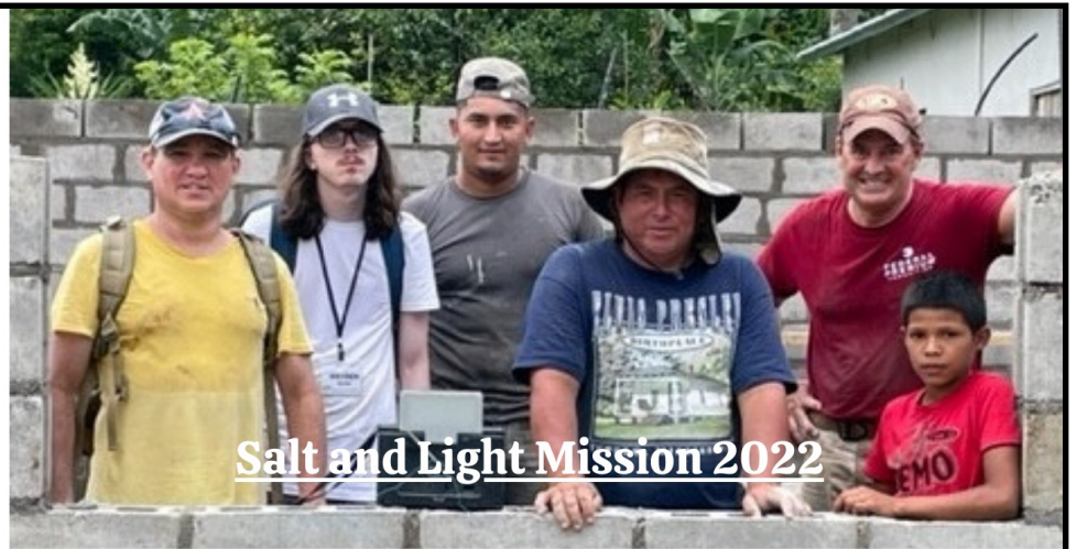
Salt and Light Mission 2022