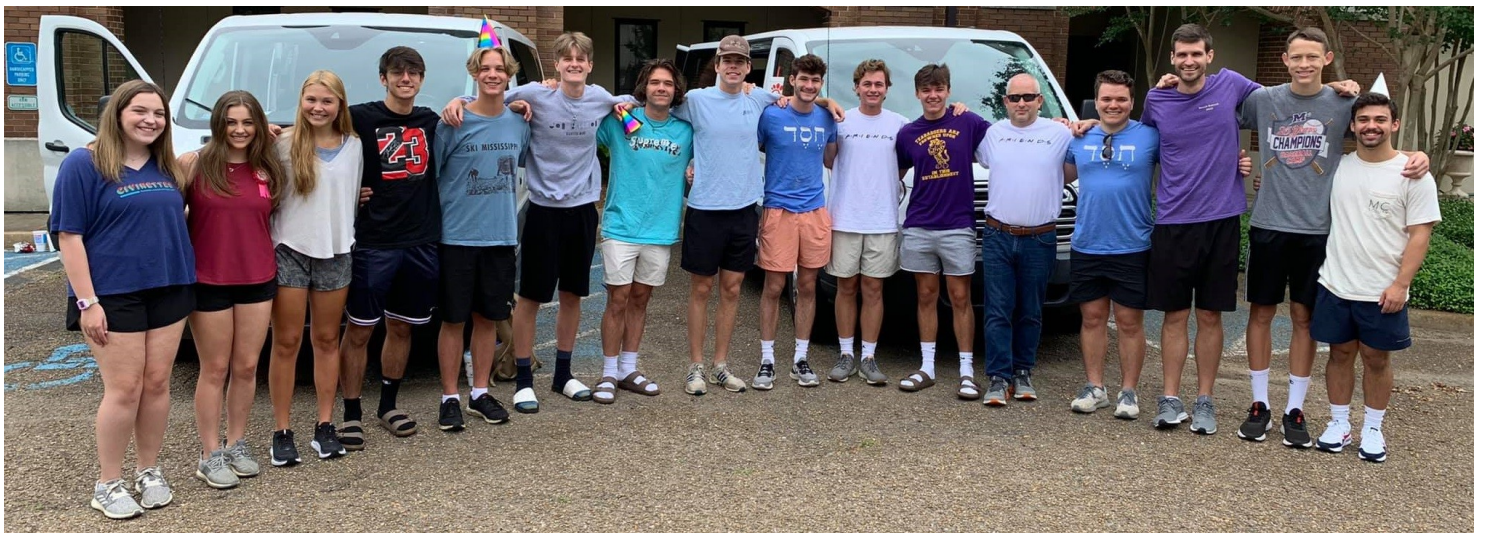
Student Ministry Senior High Team ready to set off for Fort Myers, Florida, for a week of mission work.