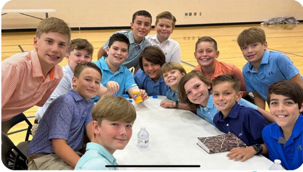
6th grade boys