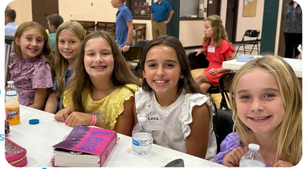
4th grade girls