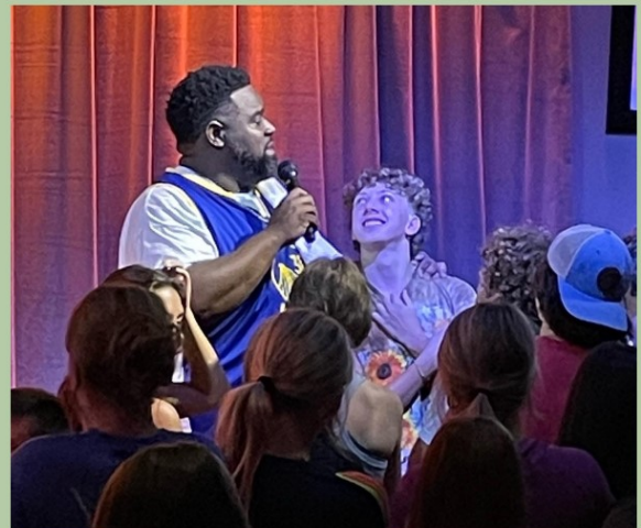
MUMC Student Ministry hosted the GATHERING TOUR on Sunday night (August 21)