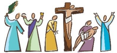
The Passion Play

WHO: 4 th & 5 th Graders WHAT: Go to Kosciusko United Methodist Church's Passion Play WHEN: Thursday, April 14 – leave the Church at 5:00 p.m. & return approximately 10:30/11:00 p.m. BRING: Blankets, jackets, & folding chairs - the play is outside! VOLUNTEERS: Van drivers ( renee@madisonumc.org to volunteer) Chaperones ( renee@madisonumc.org to volunteer) REQUIRED INFO: Each child MUST be registered & have a signed Activity Participation Form (email renee@madisonumc.org for the form) - return completed form no later than Wednesday, April 13 RSVP: To ( renee@madisonumc.org ) no later than Sunday, April 10